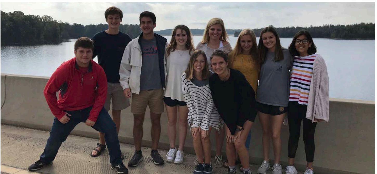
Junior Conservancy visits Hard Labor Creek Reservoir on the Greenprint Ramble

Junior Conservancy students got up bright and early on a cold November morning to help vendors set up for the annual Bostwick Cotton Gin Festival. This event celebrates the agricultural community with proceeds benefiting the historic Susie Agnes Hotel and other city improvements, and was a great way for the Junior Conservancy to give back to the community.