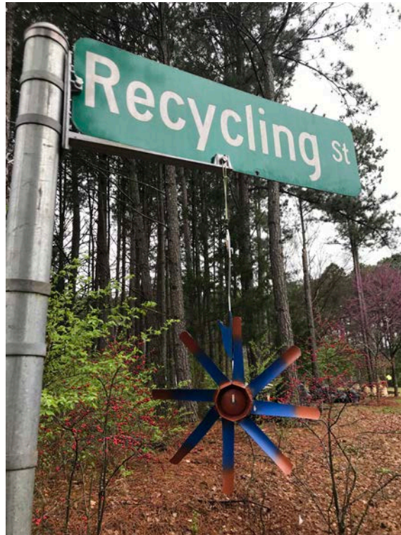
Sign at the Athens-Clarke County Recycling Center