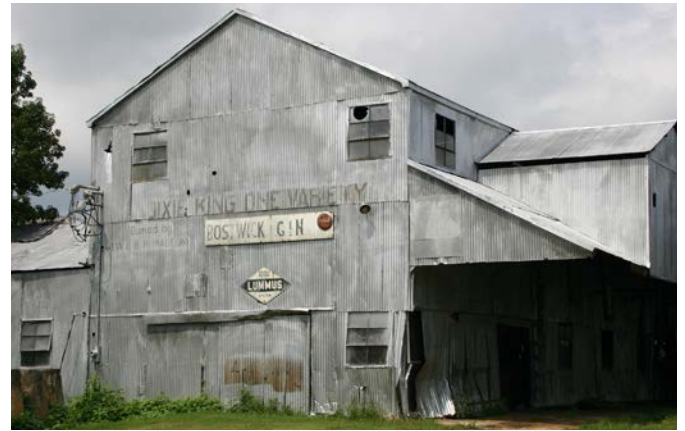
Cotton continues to be ginned and celebrated in Bostwick