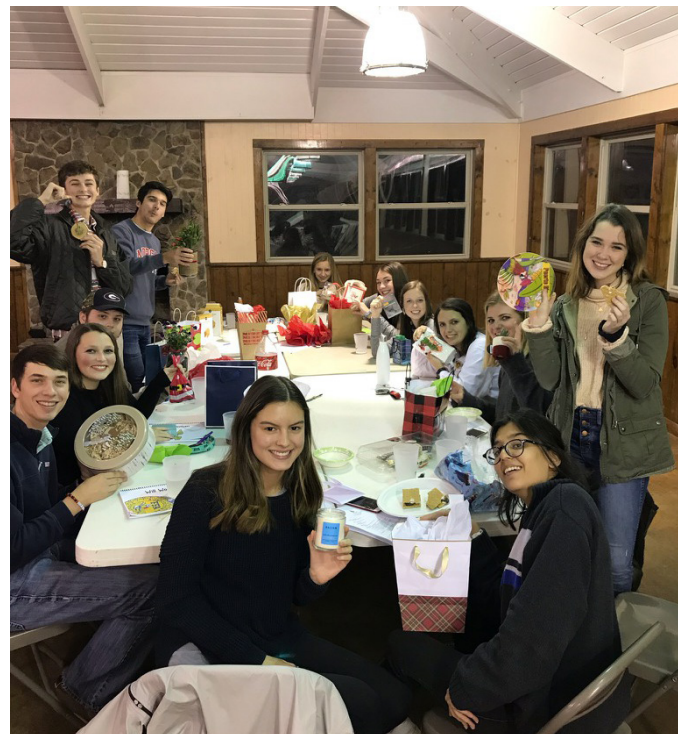
Junior Conservancy students exchanged hand-made or used gifts

Social events held during the year included: kayaking at Hard Labor Creek State Park to kick-off the year, a "green" white-elephant gift exchange for the holidays, and an afternoon by Lake Malcom for the end of the school year celebration in May.