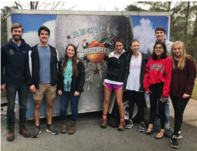
Junior Conservancy students at the Athens Recycling Center

Upon the request of Morgan County, the Junior Conservancy took up a challenging task of researching the current state of waste management in the county, and ways that it could be improved. Students researched what becomes of waste and recycled materials, both in Madison and Morgan County, and identified several challenges in the system, such as contaminated recycled materials and the lack of public education about waste management. As a result of their research, the students decided to take action by designing a graphic to inform the public on good recycling practices, encouraging use of re-usable bags, and teaching fellow students about how to recycle.