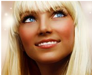
Is This What's Putting Tanning Salons Out Of Business? Tan Physics