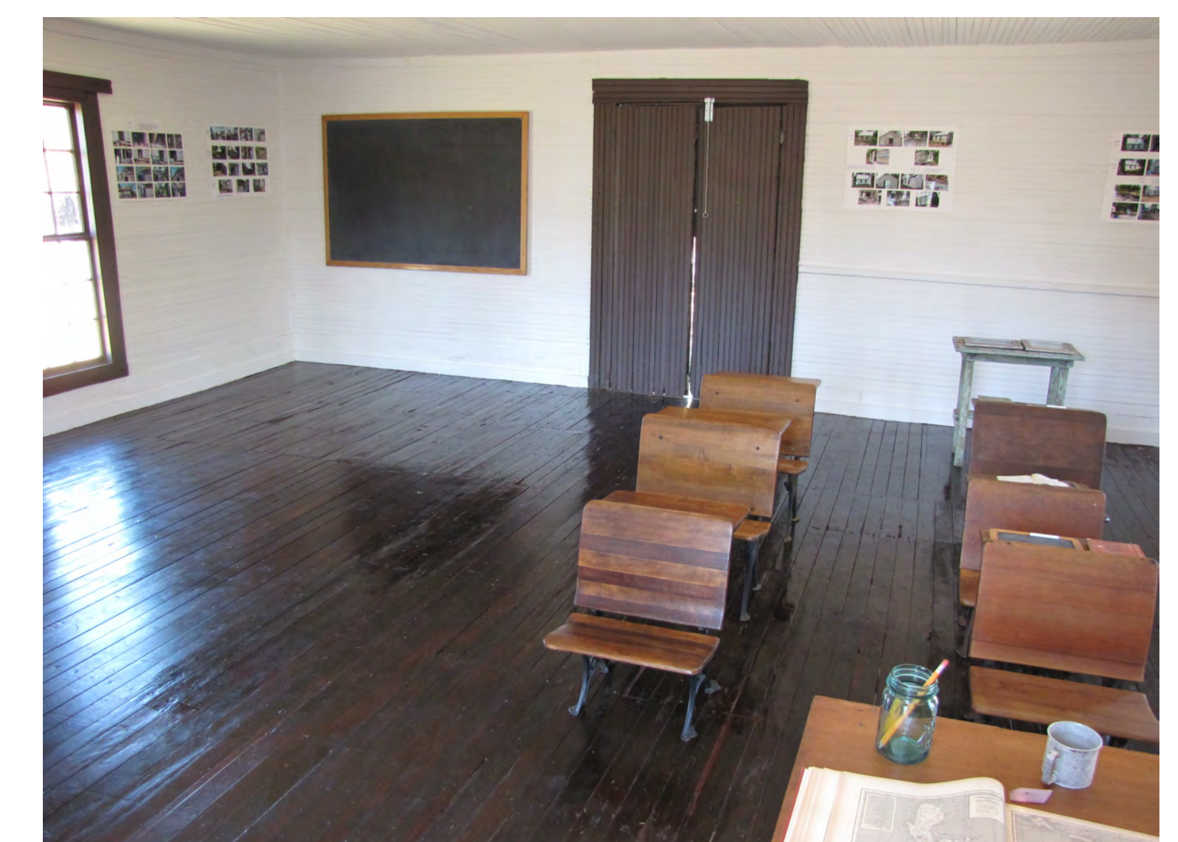
Above: Interior after restoration

The restoration of the structure will give Wallace Grove Baptist Church the opportunity to interpret an important part of Morgan County's educational and black history for years to come.