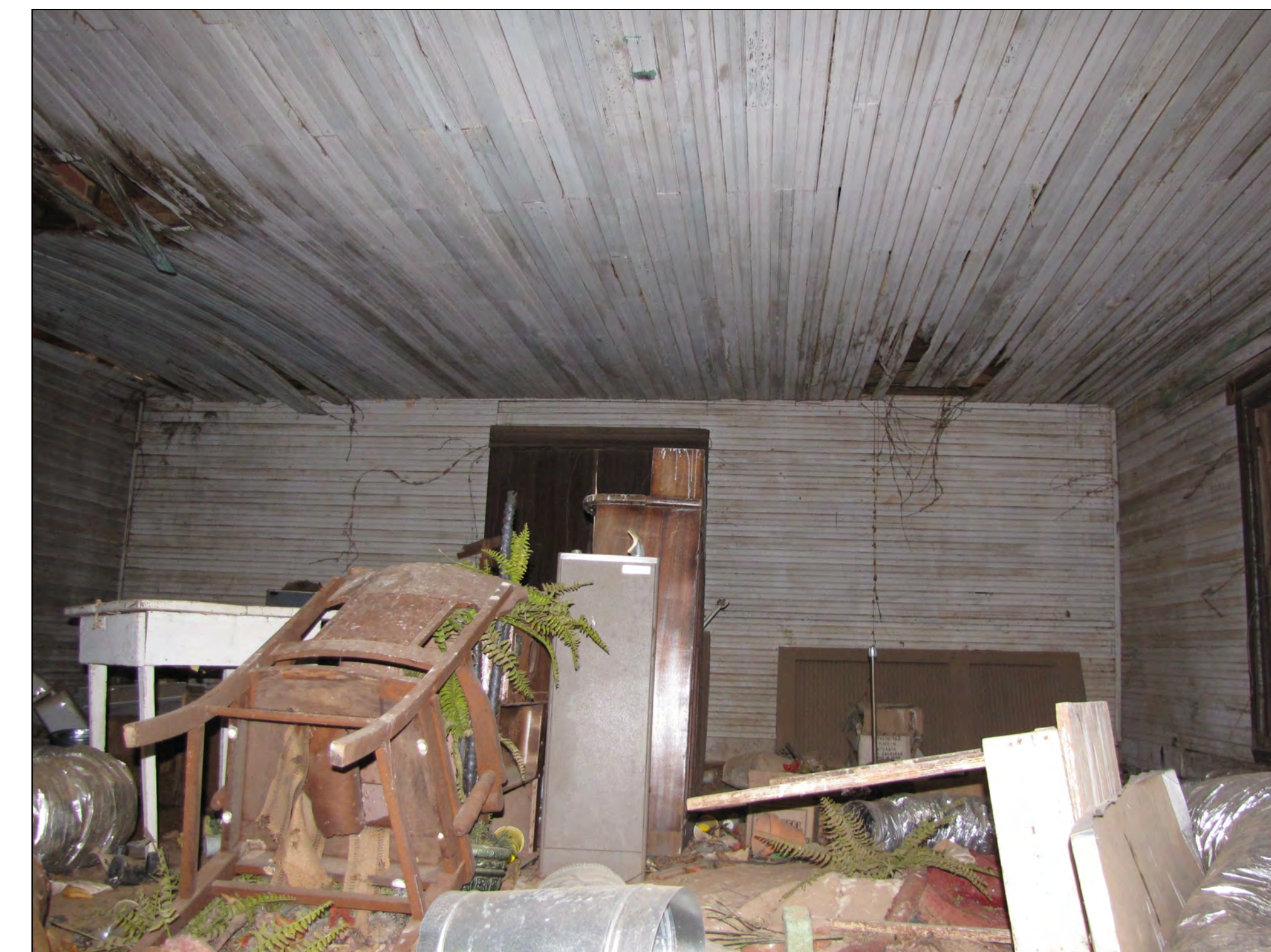
Above: Interior before restoration; Below: Exterior mid-restoration.

In March of 2011, Pastor Tommy Chatman and members of the Wallace Grove Baptist Church conducted a clean up of the grounds around the school, and began the restoration.